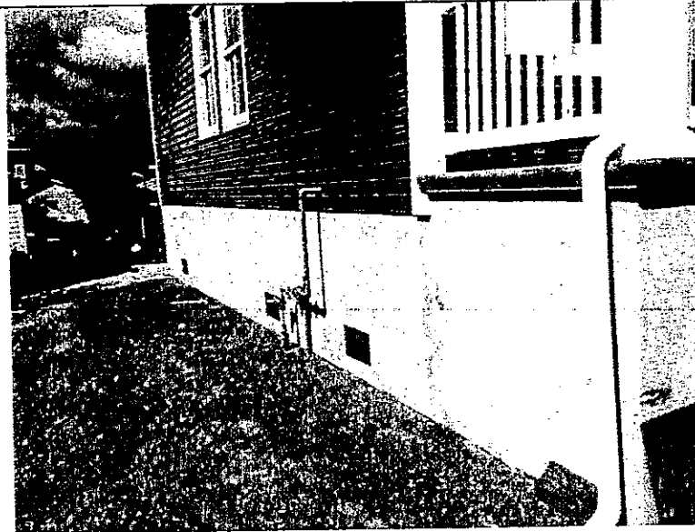
13 Sands Point Road, Left Side, 9/27/13

If submitting more photographs than will fit on the preceding page, affix the additional photographs below. Identify all photographs with: date taken; "Front View" and "Rear View"; and, if required, "Right Side View" and "Left Side View." When applicable, photographs must show the foundation with representative examples of the flood openings or vents, as indicated in Section A8.