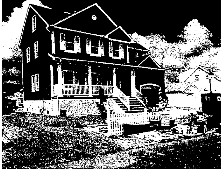
13 Sands Point Road, Front, 9/27/13

If using the Elevation Certificate to obtain NFIP flood insurance, affix at least 2 building photographs below according to the instructions for Item A6. Identify all photographs with date taken; "Front View" and "Rear View"; and, if required, "Right Side View" and "Left Side View." When applicable, photographs must show the foundation with representative examples of the flood openings or vents, as indicated in Section A8. If submitting more photographs than will fit on this page, use the Continuation Page.